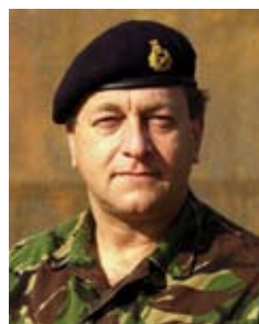
Lieutenant General Dick Applegate