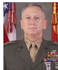
Lieutenant General James Mattis