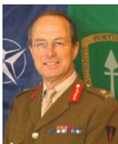
Lieutenant General Sir David Richards